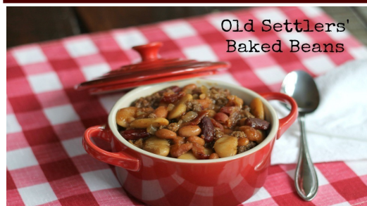
Old Settlers' Baked Beans